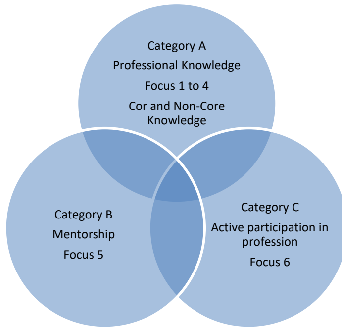
Figure 1: Categories of professional knowledge development from a CPD perspective.